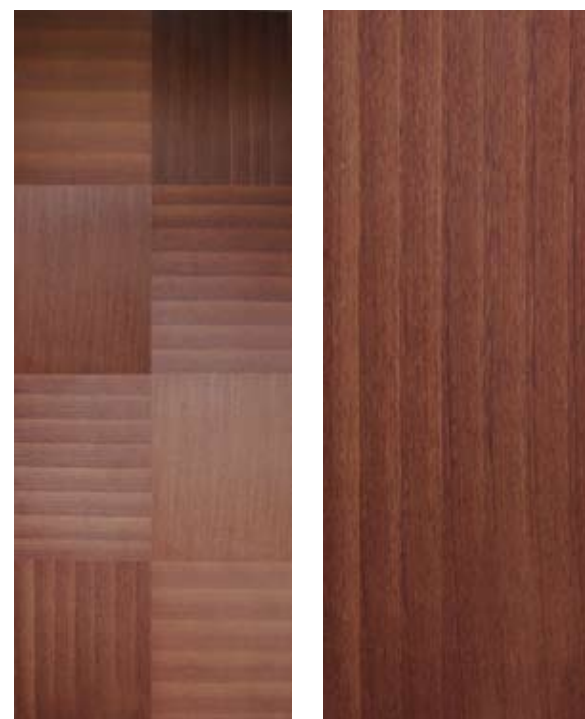
WENGE - KEN BANGSAR CONDO